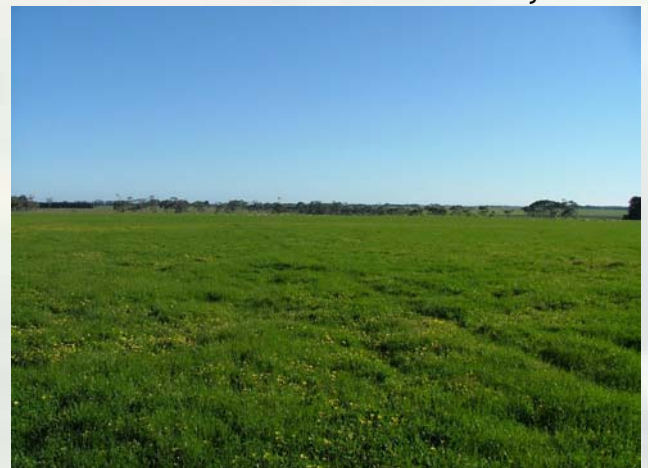
Looking south across the proposed site

A determination that the proposed Woolsthorpe wind farm would not affect nationally significant or endangered flora and fauna was received from the Commonwealth Government in February 2005.